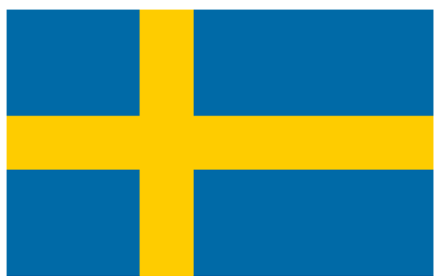
Swede-Wetland: Skåne, Raan

Goal: To generate the science evidence-base that is needed to mainstream BwN solutions in national policy and investment programmes. Why: To make coasts, estuaries and catchments of the North Sea Region (NSR) more adaptable and resilient to the effects of climate change and to attain multiple benefits. Hence, to better protect people communities, infrastructure and economy from the impacts of flooding and coast erosion. How: The project builds on existing investment projects and uses transnational best practice, performance monitoring and co-analysis to develop improved cost-benefit analysis and business case methodology for BwN