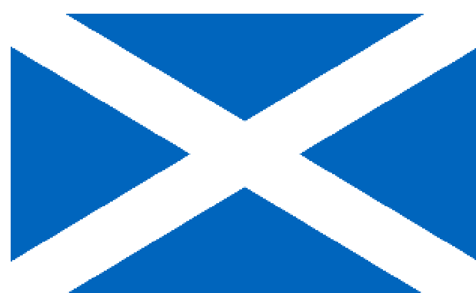
Scotland-Headwater: Tweed River