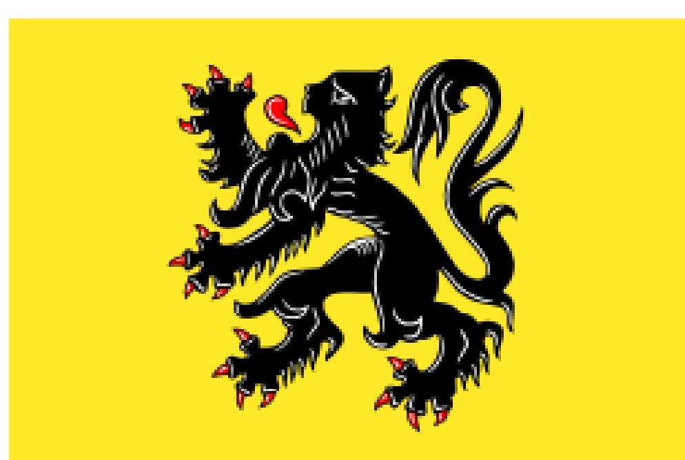
Flanders-Small stream: Kleine Nete

Common denominator as proposed solution: Nature based features (BwN)