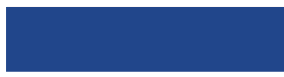
Netherlands-Delta: Side channels in Rhine and Meuse system